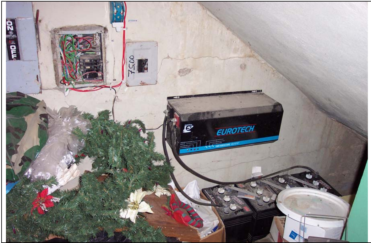
Inverter and Batteries

The batteries are all 6 V, 225 Amp-Hour batteries, which require maintenance. It seems that in the DR, you cannot purchase gel, sealed batteries for some reason. This may be because of the temperature or humidity, but we think it is simply because the country is not as technologically advanced as ours is. The inverter is a single-phase inverter and is plugged directly into the lines coming from the pump breakers on the other side of the building. The blue switch that is at the top of the picture is a manual switch between power from the grid and power from the batteries. The power from the grid is on between the hours of 8:30 am to 4:30 pm. After this the batteries must be used, along with the diesel generator, which is currently broken. Unfortunately, the clinic's power needs require the batteries to be discharged to 20% capacity, which makes the clinic have to replace the batteries every 6 months. Each battery costs approximately $80 US, which means that they have an annual cost of $640 or 17,920 pesos for the batteries, which is a lot of money to them. Simply replacing the batteries with sealed batteries, and a larger number of them would save them money. The box with all the wires in it contains the breakers for the first floor, and the breakers next to it are for the inverters.