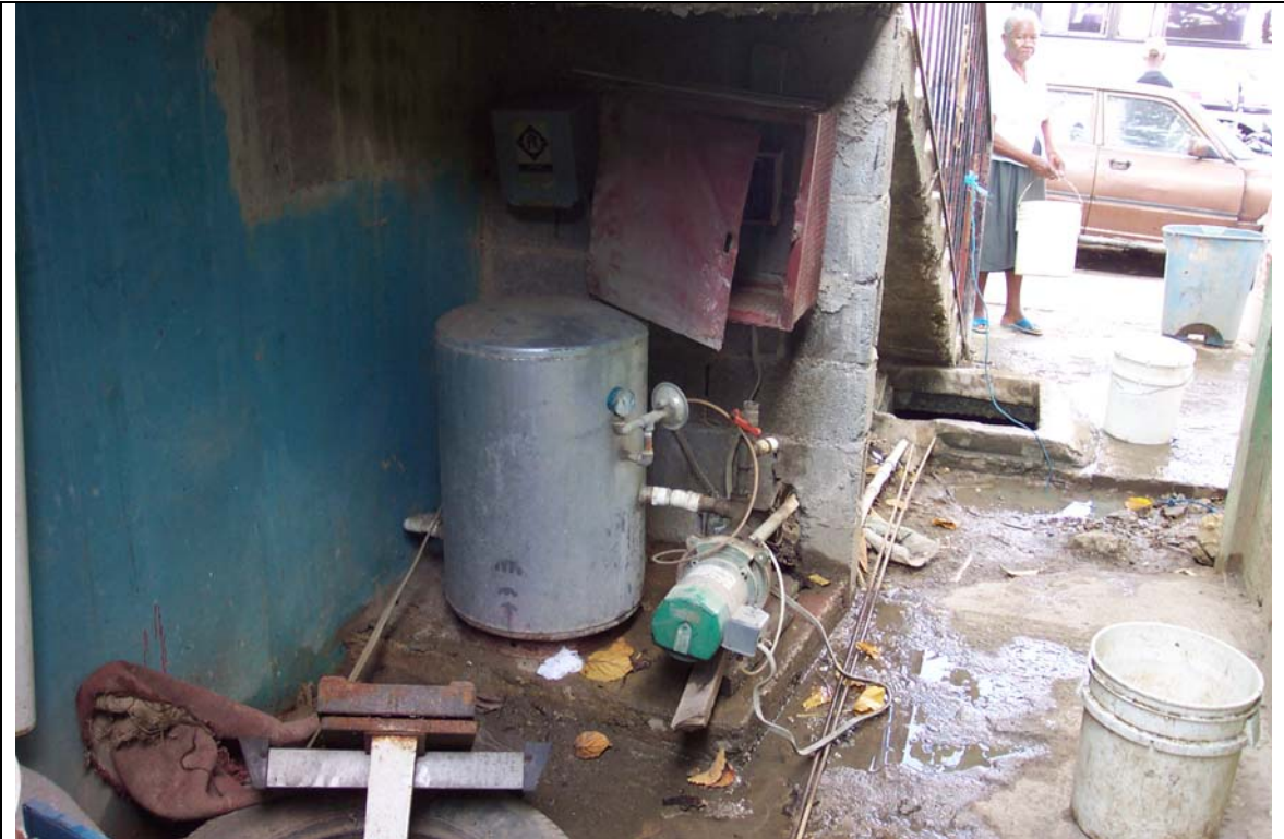
The Jet Pump and Pressure Tank in the Foreground, the Cistern in the Background