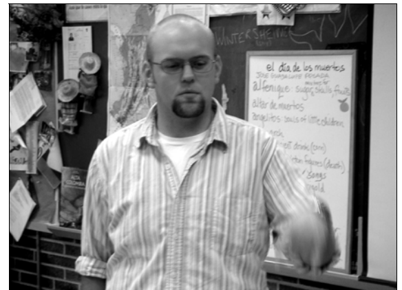
The substitute, seen here teaching Spanish

learned, was again seen at lunch that day when he approached a table of students and asked for a piece of gum, citing that he "just had Taco Bell" and had "some serious burrito breath."