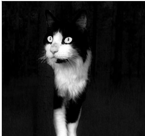
One of the cats emerges from the night.

After a while, the strange visitors said that they had to be going, and wandered off into the darkness, never to be seen again